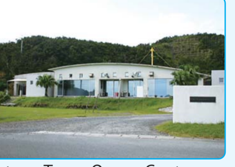
Nakatane Town Onsen Center