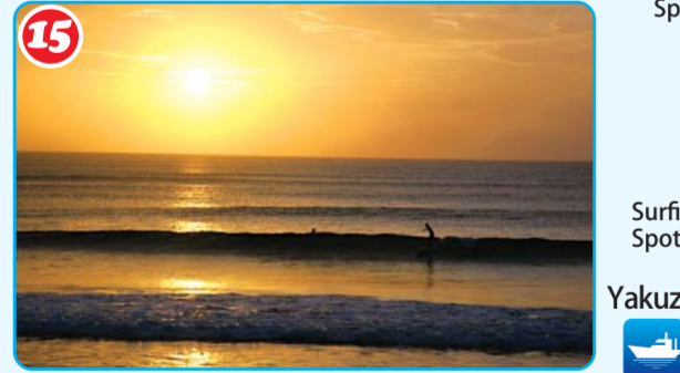
Nagahama Beach (Yakuzu)

Tanegashiman is a community-based group of characters who mainly perform on Tanegashima. Through their performances they tackle the issues that people living on remote islands face such as the ageing problem and youth leaving their hometown. The Tanegashima Action Club was awarded a special award of the First Community Recovery Award in February 2011. "You are going to witness new miracles and legends..."