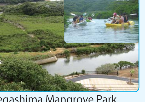
Tanegashima Mangrove Park