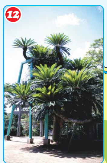
The largest sago palm in Japan