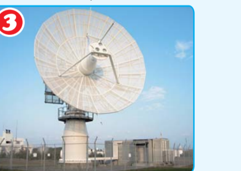
Masuda Space Tracking and Communication Station