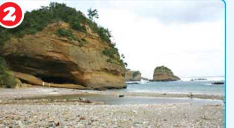
Injo Beach (Matate-no-Waya Shoreline Cave)