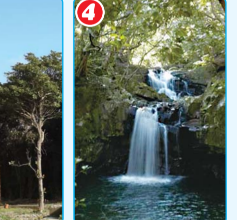
Obuchi and Mebuchi Waterfall